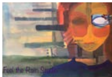
Somber Vision Watercolor on Paper