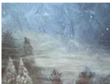
When the Fog Lifts Acrylic on canvas