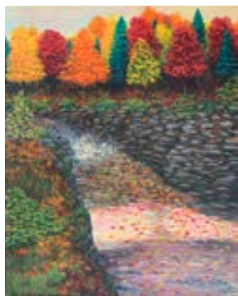
Autumn Falls Acrylic on Canvas