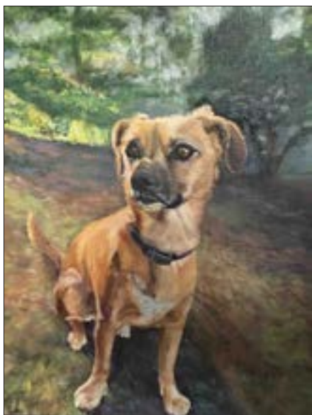
"Chloe" 2023 Oil on canvas 20" x 16"

Kelley Bush recently completed these 2 art projects. Be sure to check more pet portraits at https://www.facebook.com/petportraitsbykelleybush/