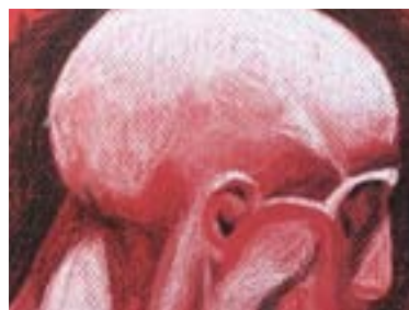
Laid Bare Charcoal on colored paper