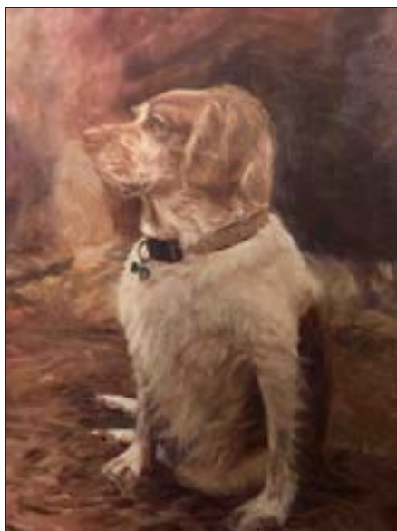
"Copper" 2023 Oil on Canvas 20" x 16"