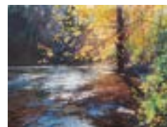
"Glimmer of Hope"

Friday Night Wine & Cheese/Meet & Greet: FREE for workshop participants. All others: Suggested donation: $10-$15.