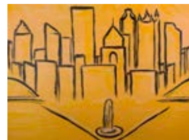
Golden Triangle Acrylic on canvas