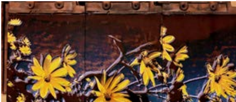
Debra Tobin - "Resilience", Roof Tiles from the Stifel Fine Art Center