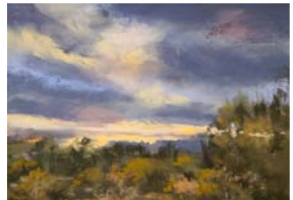
Cindy Gilberti "Taos Sunset", 9 x 12" pastel