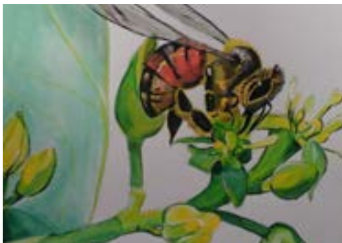
Ralph Bonnar "BEE IN A TREE" 12"x9" acrylic on blue 135 lb paper