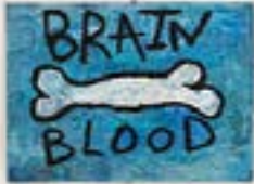
BRAIN BONE BLOOD 707 Gallery Through May 15