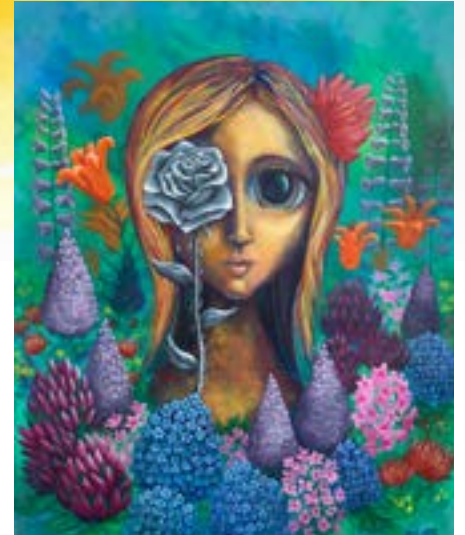
Emily Glass - "Blind Eye"