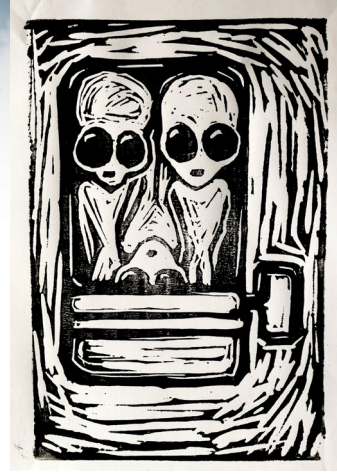
Lynda Kirby "I Need Some Space"