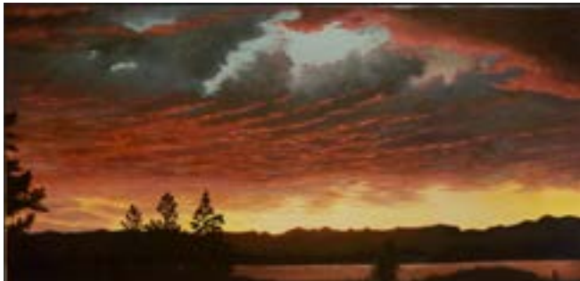
Lance Maloney Flathead Lake Sunset - Acrylic