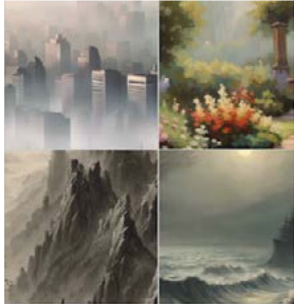
Helena Valentine AI generated - Atmospheric Perspective: Cityscape, Garden Scape, Mountain Scape, Ocean Scape.