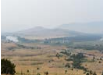
Lance Maloney Flathead River as seen from the National Bison Range MT.