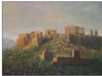
Lance Maloney Acropolis Athens Greece - Oil