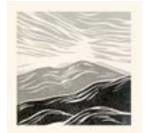
Lynda Kirby Appalachian Hills - Block Print