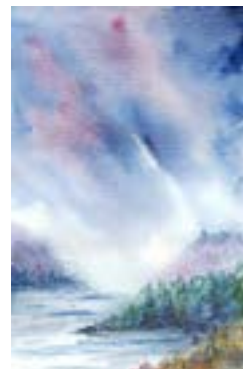
Josette Baker "Big Sky Country", watercolor