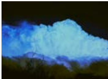
Lance Maloney Ominous Cloud