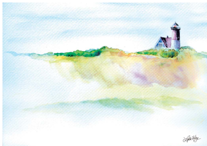
Lynda Kirby "New England Lighthouse" Plein Air Watercolor