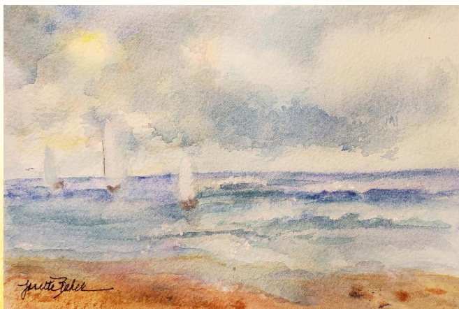
Josette Baker "Sails on the Chesapeake", 5" X 7", Miniature Watercolor This little painting stirs fond memories of summer sailboat races on the bay where I served on the crew flying the sails to capture the wind, tacking our vessel to gain best advantage.